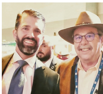
Two strong conservatives standing side by side. Donald Jr. and Steve Zipperman at Turning Point USA.